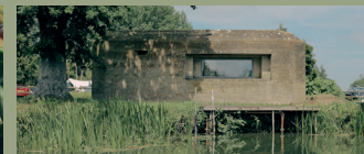
Campsite Gift shop