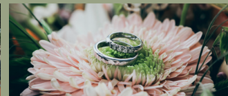
Wedding in the Barn