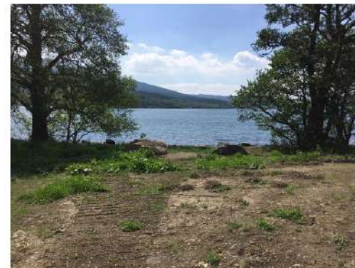
Entrance onto the beach

No problem! Take in the scenery from the comfort of your plot with seating & fire pits available on the beach.