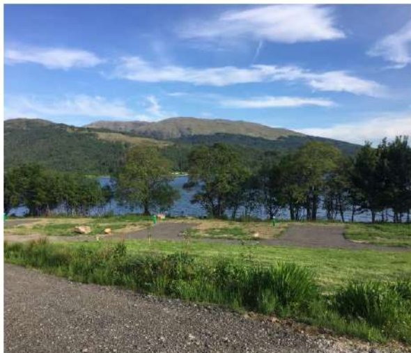
Plots #4 and 5 looking out over Loch Creran