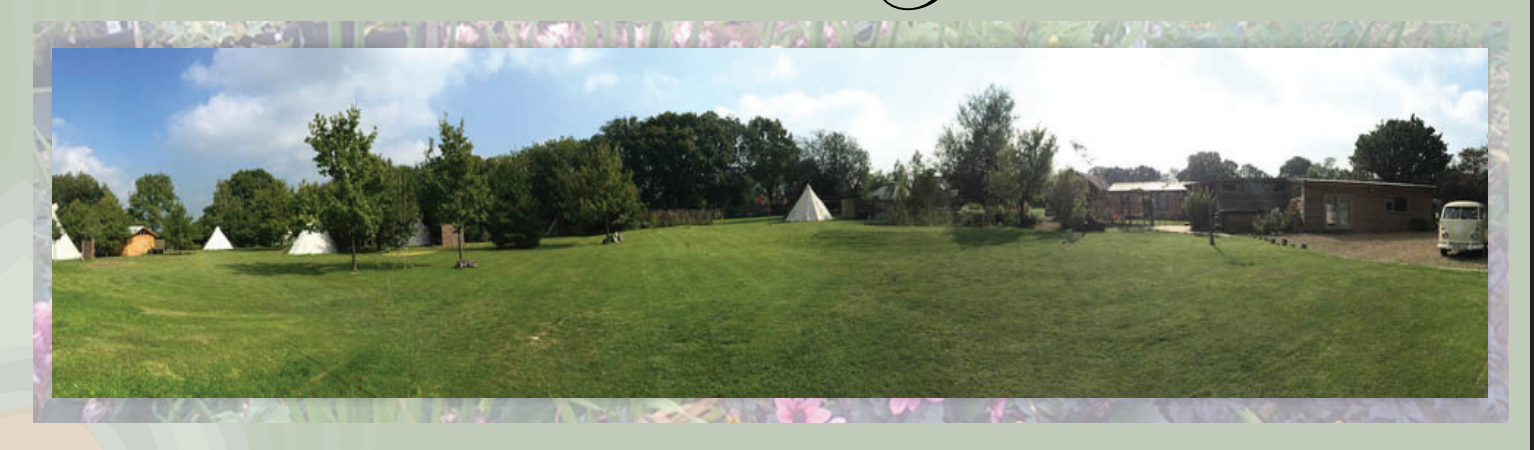
The Glampsite chill out area makes the perfect gathering place, especially when dressed with straw bales & rugs. There is power, water, self catering facilities, fridges and a fire pit.