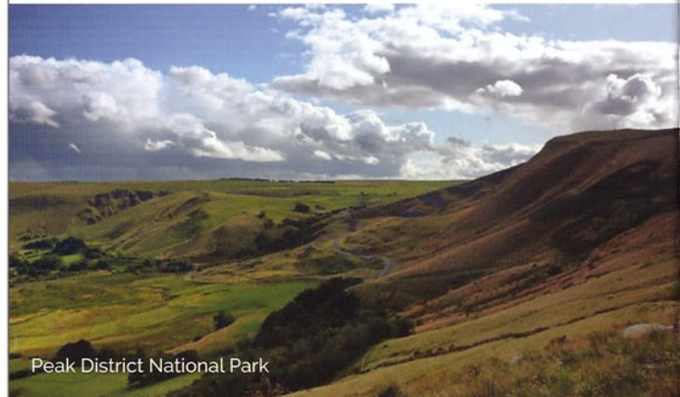
Peak District National Park

Derbyshire and surrounding areas offer visitors to Riddings Wood a whole range of fun activities and family days out. From cycling and walking in the Peak District to visiting historical attractions or sampling the local food and drink on offer in one of the area's many tea rooms, family pubs and restaurants, we are sure you will enjoy your stay with us.