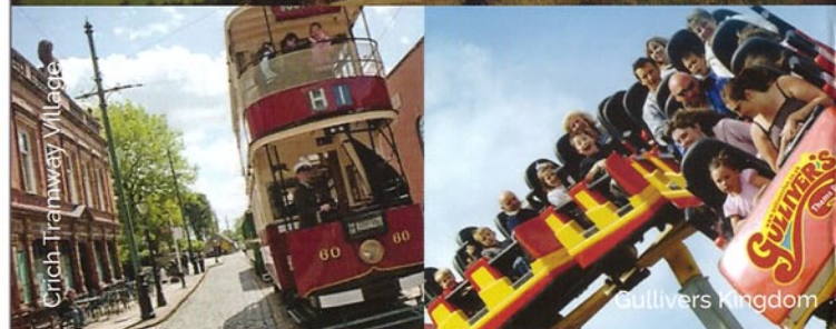
Crich Tramway Village