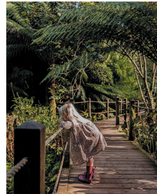
The Lost Gardens of Heligan