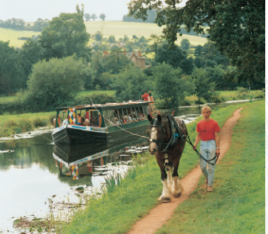
Tiverton Canal, Mid Devon