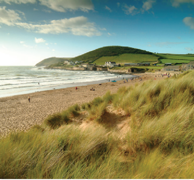
Croyde Bay, North Devon

You will never do it all, but it's fun trying – you won't want to leave!