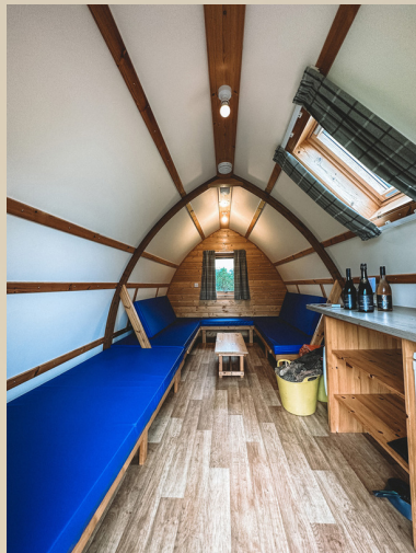
Inside the wigwam When you arrive.

Bedding Hire: £15 per single pack or £25 per double pack (Bottom Sheet, Duvet, Pillow, Towel).