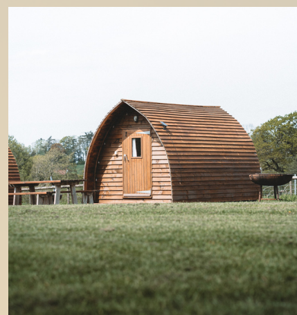
Outside each wigwam