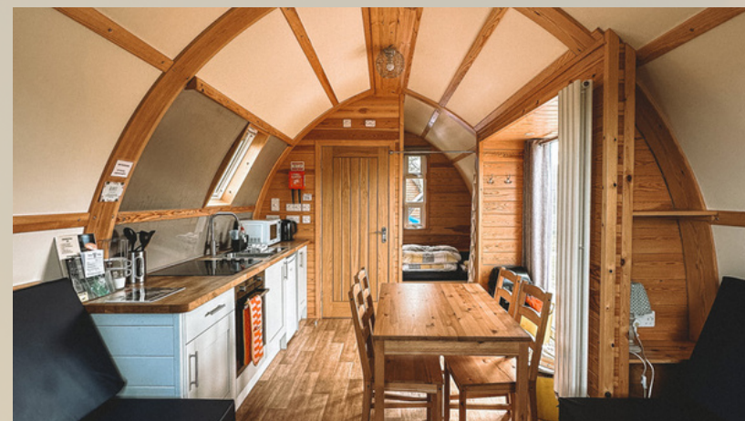
Inside the Deluxe Lodge

Complimentary Secret Valley Wine and our Own Organic Beef Burgers will be in the accommodation fridge.