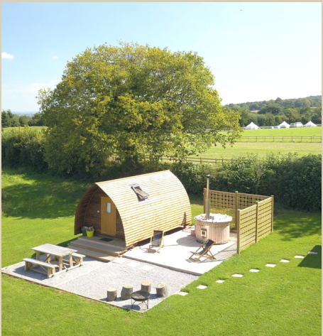
Outside each wigwam