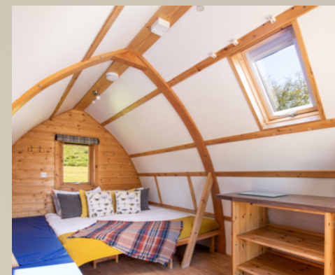
Inside the wigwams