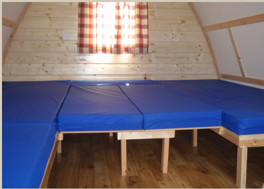
Put the back rests into the middle to make one large bed.