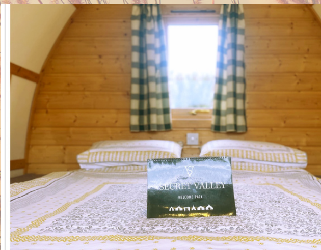
Customer Decorated Wigwam