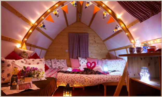
What you can make your wigwam look like! (Decorated by a customer)