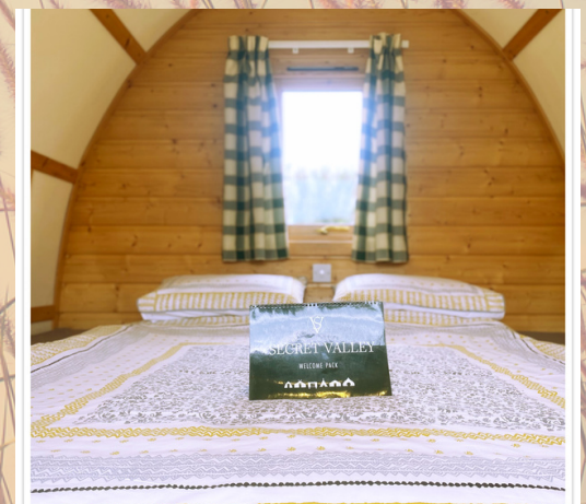
Customer Decorated Wigwam