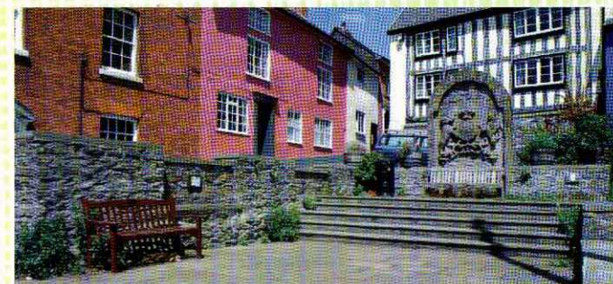
THE SQUARE, BISHOP'S CASTLE

Also within easy reach are castles, working museums of industry and agriculture, many superb walks, including the rugged beauty of the Stiperstones, the Long Mynd with its breathtaking views and even a step back in time along Offa's Dyke path.