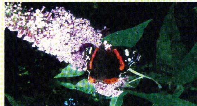
RED ADMIRAL FEEDING ON BUDDLEIA

There are also badger sets and many different varieties of wild flowers. The park has been accredited with a David Bellamy Gold Conservation award since 2000.