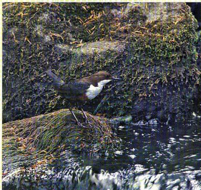
ONE OF THE RESIDENT DIPPERS

Attractions The area provides the holidaymaker with a wealth of attractions, including the festival town of Ludlow, famous for its festival and Michelin starred restaurants, the beautiful medieval town of Shrewsbury and the historic town of Ironbridge with its famous bridge and the fascinating Ironbridge Gorge museums.