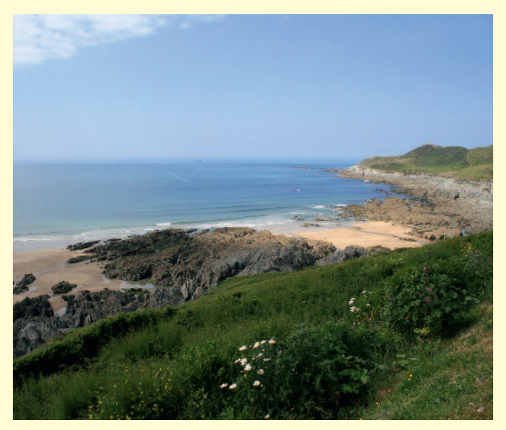
Woolacombe is an award winning beach, ideal for a family seaside holiday.

Warcombe is the perfect place for a family holiday. We are close to the fabulous Woolacombe Bay which offers safe bathing, great surfing, glorious views and miles of golden sand. Woolacombe has lots to offer for everyone to enjoy.