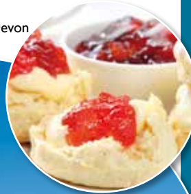
Delicious Devon Cream Teas

Dornafield nestles in a tranquil valley surrounded by Devon farmland, yet within easy reach of the beaches and amenities of Torquay and the English Riviera; the rugged beauty of Dartmoor and the charming coastal villages of the South Hams. The historic cities of Plymouth & Exeter and the Elizabethan town of Totnes are a short drive away. It is above all a site for families and a member of the Dewhirst family is always on hand to give help, local advice, or simply to ensure that your holiday runs smoothly.