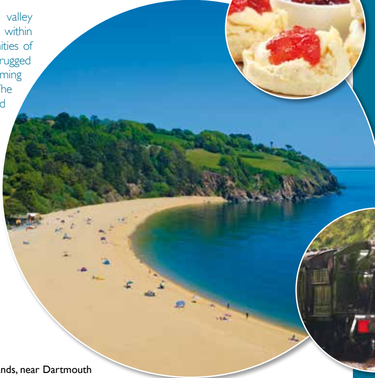
Blackpool Sands, near Dartmouth

Dornafield is in an ideal location to explore the unspoilt surroundings of South Devon. Why not visit our Tourist Information Centre for more details of interesting places to visit? There are a great many things to do and see or simply relax in one of many pubs and restaurants nearby.