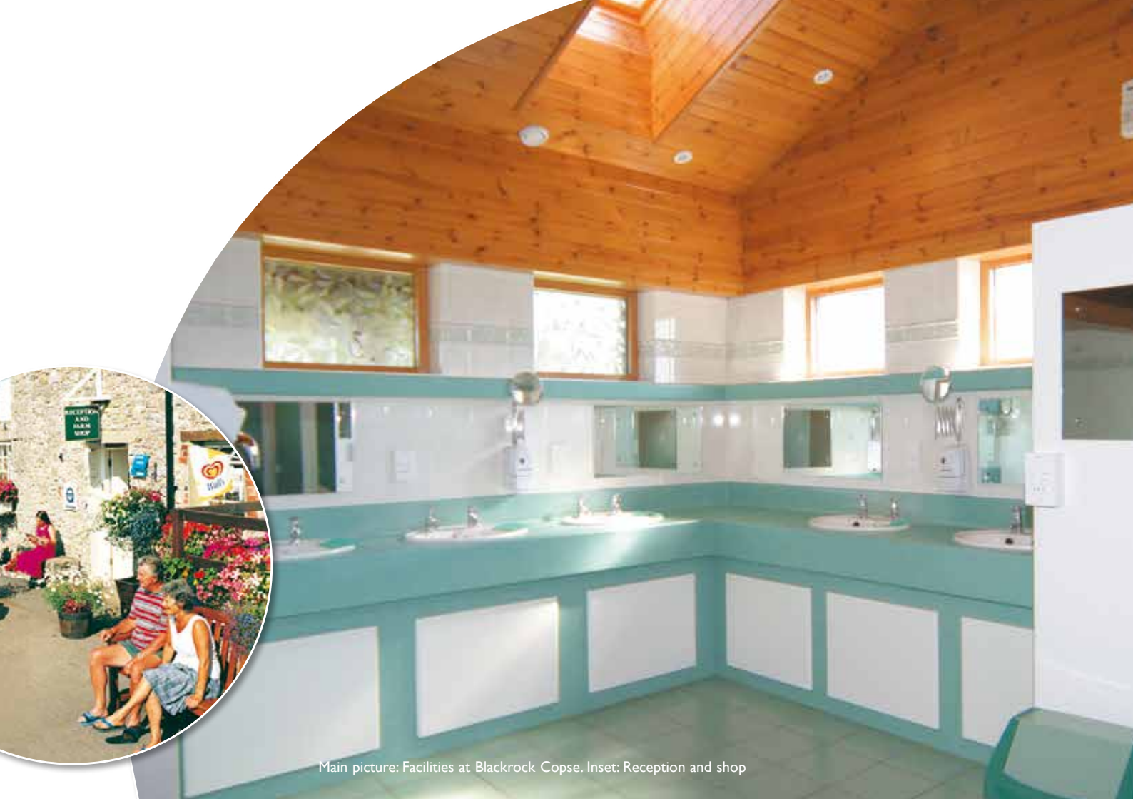
Main picture: Facilities at Blackrock Copse. Inset: Reception and shop