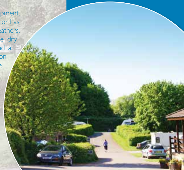
Pictured: Dornafield's award winning facilities.

Blackrock Copse has its own woodland adventure area with swings and play equipment and is overlooked by a lovely open hill top with wonderful views of Dartmoor, ideal for kite flying. Dogs have another extensive off-lead exercise area.