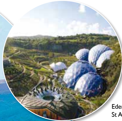
Eden Project, St Austell, Cornwall