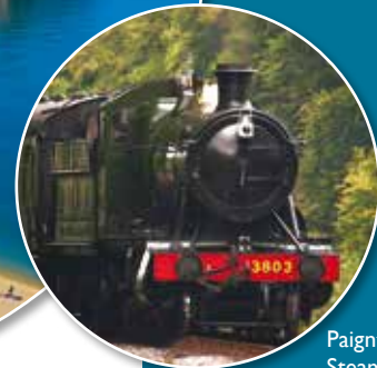
Paignton & Dartmouth Steam Railway

Dornafield is in an ideal location to explore the unspoilt surroundings of South Devon. Why not visit our Tourist Information Centre for more details of interesting places to visit? There are a great many things to do and see or simply relax in one of many pubs and restaurants nearby.