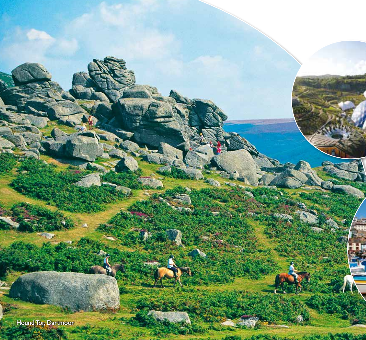
Hound Tor, Dartmoor